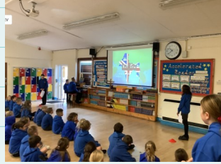
Collective Worship Committee