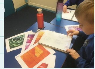
Ennerdale Abstract art

Check out some of the other galleries showing the children learning and exploring a range of different topics. Check out your child's class page here.